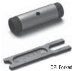
CPI Forked Tubes and Platforms, P/N 4090-09 (Shown here with the preinserted platform removed).

These tubes are shipped with pre-inserted platforms for your convenience. Since the platform contacts the tube wall only at each corner, atomization of the sample occurs over a shorter time, producing sharper, taller peaks. The solid pyrolytic graphite platform, and lack of exposed base graphite material in the tube, help contribute to longer tube life.